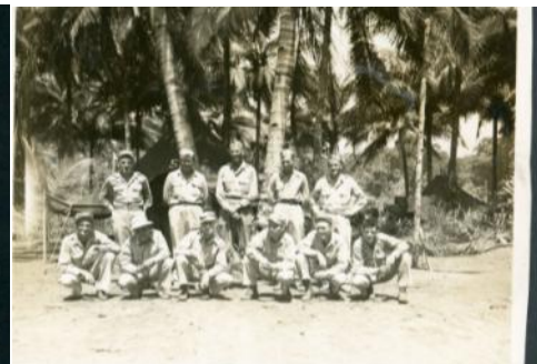
Sig Co. Officers Hollandia May '44