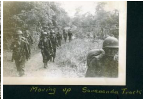
Moving up Sanananda Tracks